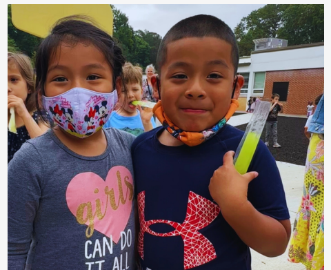
Class party awards