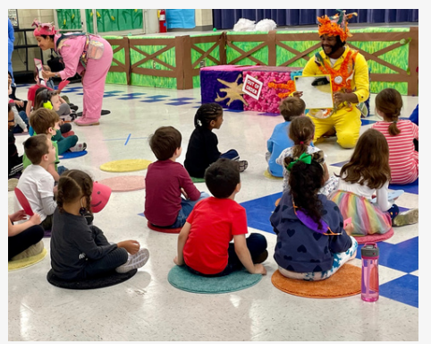
Alliance Theater performances