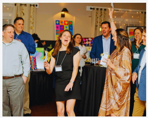
Attendees enjoyed both a silent and live auction, dinner, and dancing