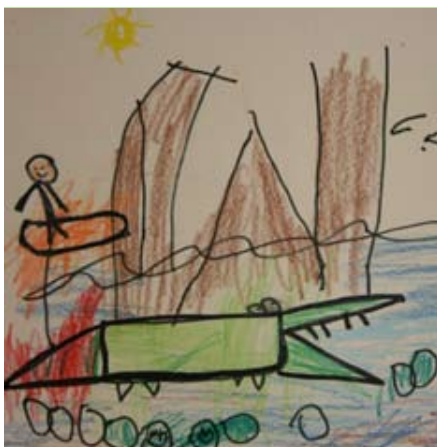
artwork by Benjamin Lutz

The "Kindergarten Goes Green!" grant has allowed us to teach in-depth about limited resources and practical solutions to reduce, reuse, and recycle. For example, our class learned how electricity is used to pump water and how water is used at power plants to create electricity. Now we understand that saving water saves energy and visa versa."