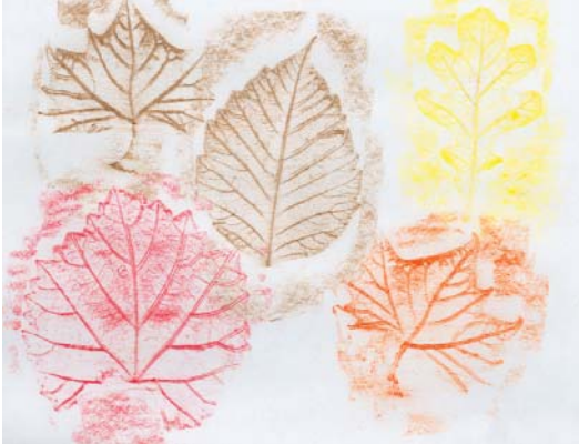
Bella Levine, Kindergarten

Together with our volunteers and donors, we will continue to make a significant difference in the lives of Coralwood's students through the exciting initiatives of the Coralwood Foundation.