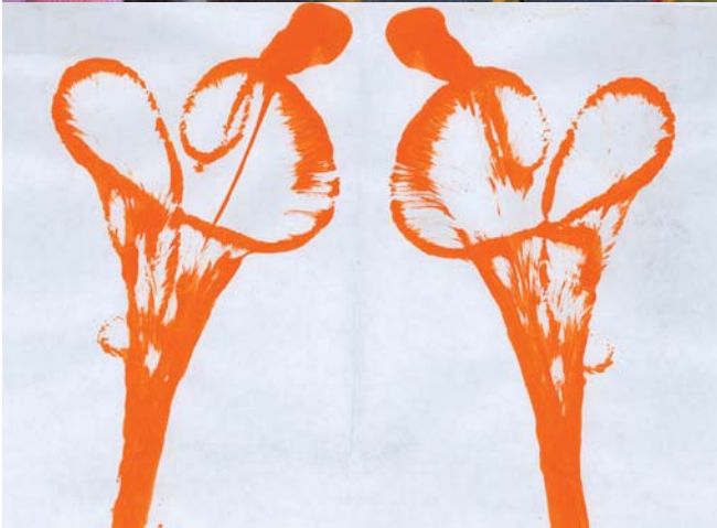
Isabel Shackelford, Kindergarten